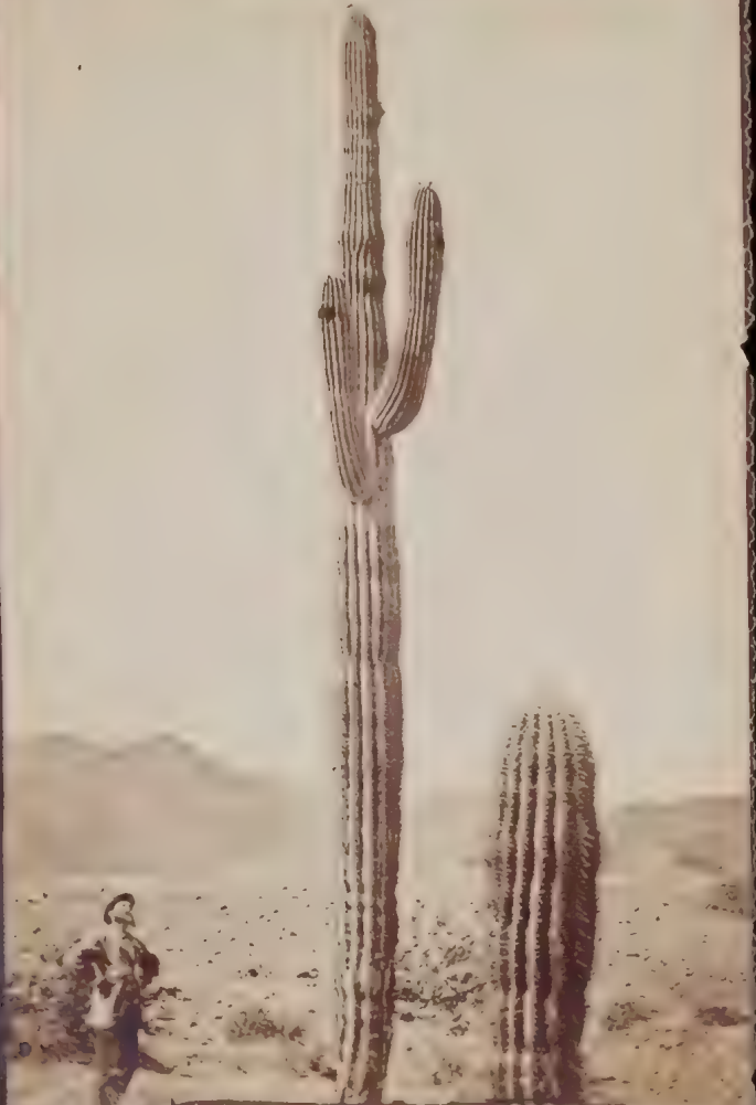
108 The Saguaro Cactus of Arizona